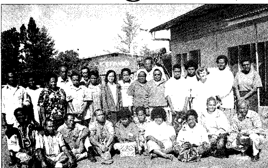
All need to be involved in the formation of good Catholic Families where Christian values will always be taught and protected.