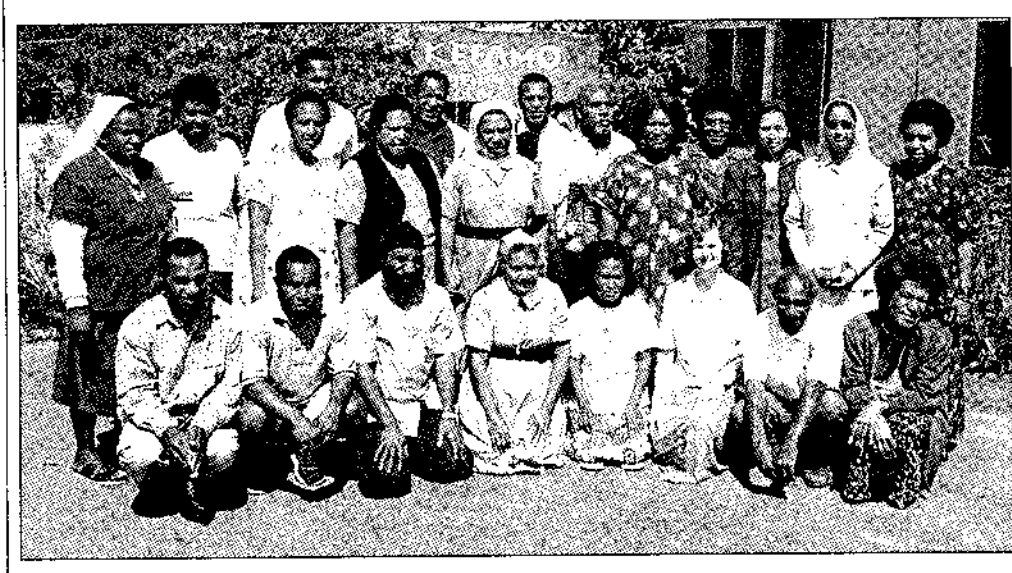
Family life Inservice: Participants of the workshop comes from nearly all the dioceses.