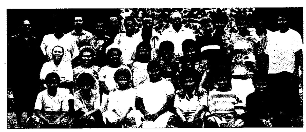
ADULT LITERACY: Participants in the Daru-Kiunga workshop.

The Diocesan Women's Service felt it was a need to develop our women to realize their role as Christian women leaders, groups where we could engage our commitment and responsibilities to reach out more to the communities through different programmes at diocesan and parish levels to educate other women and persons on the need to be sensitized and show respect to each other, children, Refugees, persons with disabilities