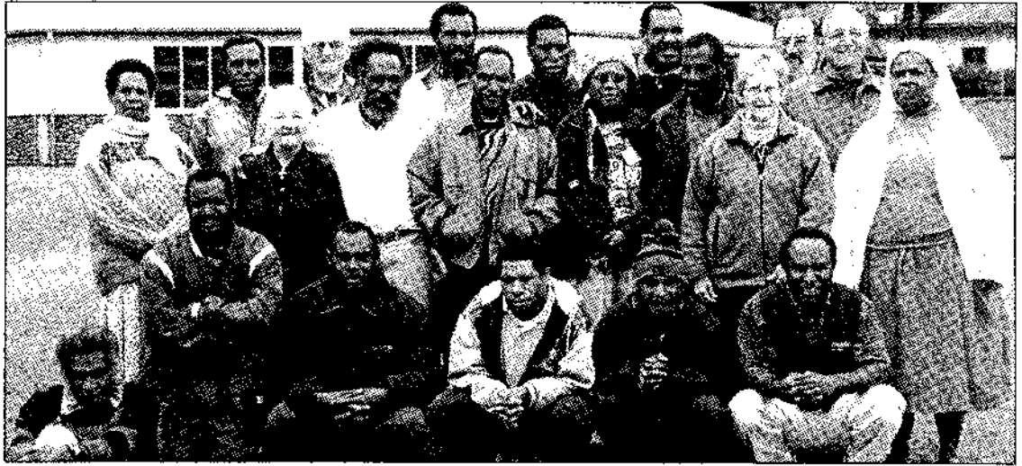
KIRIPIA WORKSHOP: They came from the Dioceses of Aitape, Wewak, Madang, Daru/Kiunga, Bereina and Mt Hagen to share and to learn.

During the planning activities four new candidates were presented for membership in the Community Animation Service of the Movement for a Better World. The happiest moment of this Convivenza was during the closing Eucharistic celebration at which these four candidates expressed their full commitment to become members of CAS.