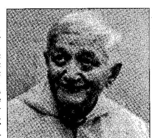
Br Roger of Taize'

Between 1962 and 1989 Brother Roger himself visited the majority of the countries of Eastern Europe, at times on the occasion of meetings with youths, permitted but watched, or of simple visits, without the possibility of speak-