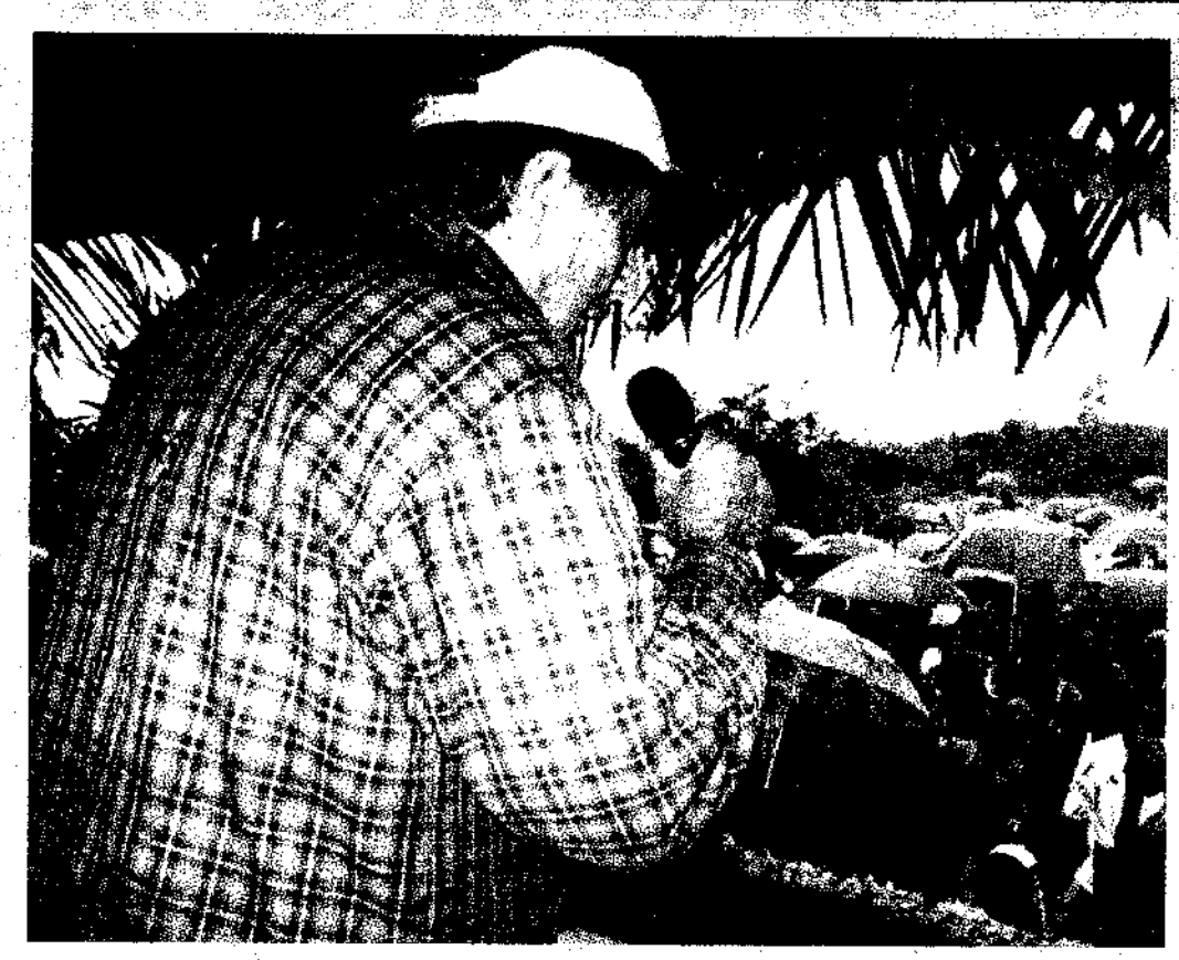
TOK PIKSA LONG PIS: Bisop Stephen Reichert i tok piksa long tupela man i wokim haus. Wanpela i wokim long ples wesan na narapela i wokim long strongpela graun, olsem na em i askim ol manmeri bilong Bela tupela wanpisin olsem, sapos yupela wokim pis antap long wesan, orait wara bai karim i go na sapos yupela wokim pis antap long ples ston bai pos bilong pis bai stap strong na bai yu i no inap kisim bagarap long tait bilong win o ren.