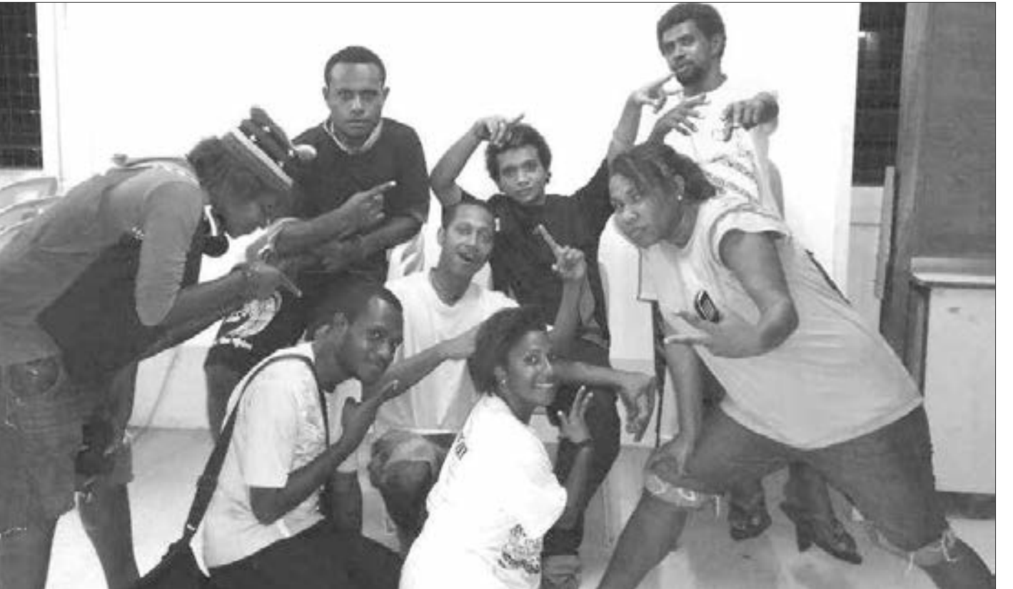
URBAN YOUTHS: Youths such as these deserve more pastoral care.

www.voiceoftorot.com/news Catholic Information Papua New Guinea|Facebook