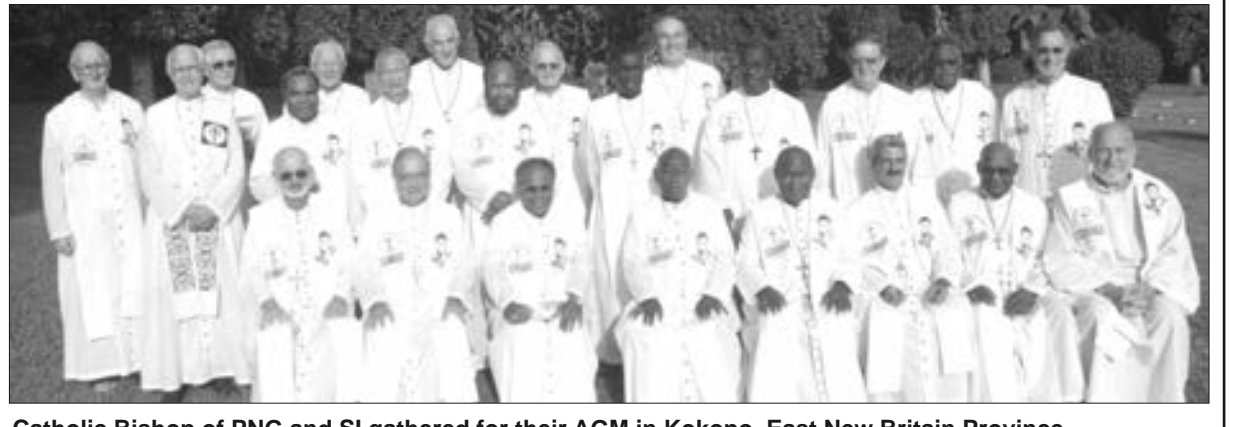
Catholic Bishop of PNG and SI gathered for their AGM in Kokopo, East New Britain Province

The participants decided to work together to disseminate information from the workshop. Partnership with existing legal bodies within their communities was also identified as an important strategy in combating gender-based violence and related domestic crimes.