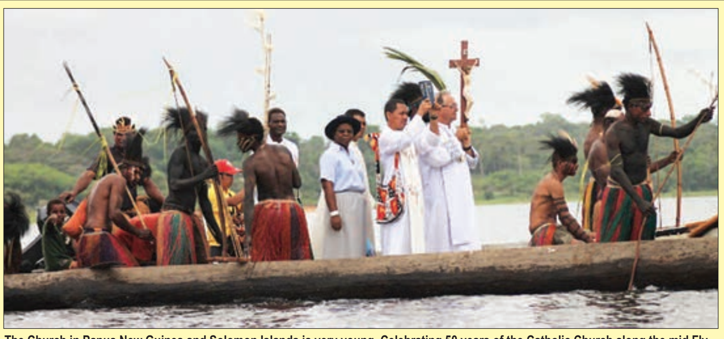
The Church in Papua New Guinea and Solomon Islands is very young. Celebrating 50 years of the Catholic Church along the mid Fly River (Oct. 2013)

May there be more seminars given to young people and young adults on sexuality, marriage and the family; and more celebrations of the sacrament of marriage.