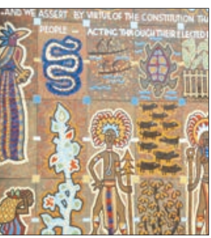
Carved image outside the PNG House of Parliament at Waigani.

There was more, however, to highlight the growing role of the country. The Minister for Treasur-