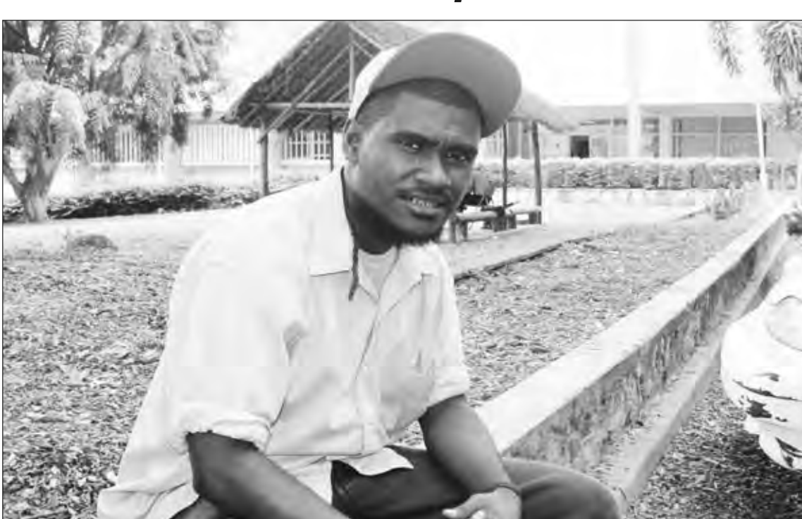
Relaxing at 5 mile NBC office Port Moresby.

He is aware of competitions such Vocal Fusion and the Digicel Stars. He had the passion to test himself