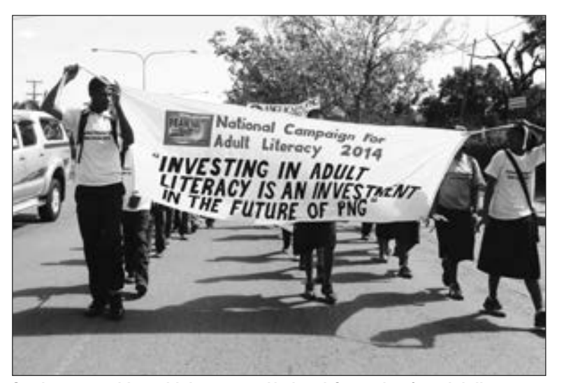
Students marching with banner on National Campaign for adult literacy day 2014.

Education and literacy survey conducted by PEAN in Simbu, Gulf, New Ireland, NCD, Sandaun and Madang Provinces (2007-2012) showed that literacy rates are estimated at 41% which is 15% less than the 2000 Census rate of 56%. This equates toover 50% of the population or a staggering4mil-