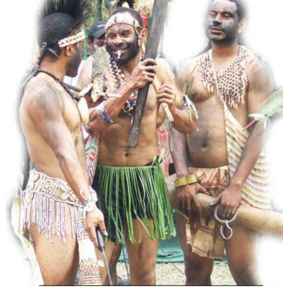
A drama group performs during the recent policy launch in Port Moresby.

"I couldn't read books, my Bible or even general information. I would buy books at the Catholic Church and ask my children to teach me to read. When I go to the bank, I am unable to read and understand the figures.