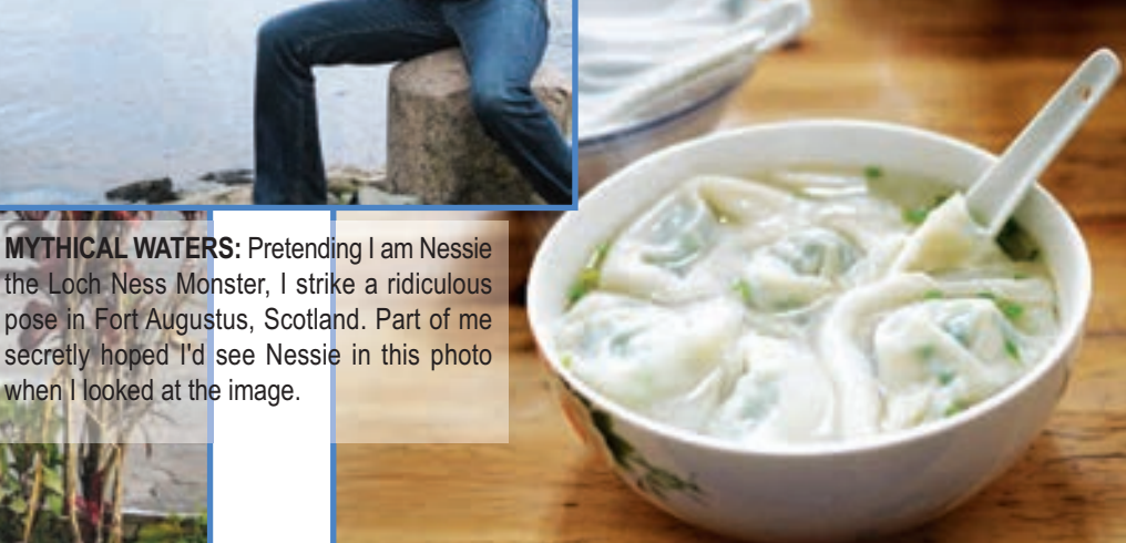
FOOD & WATER = LIFE. Without water, we have no food.

BUSY WATER: Sydney Harbour in Australia bustles with activity as boats, both large and small, zip right by the Sydney Opera House. The boats are likely rushing to avoid the storm that rolled in 10 minutes later and let leash a torrential downpour of rain.