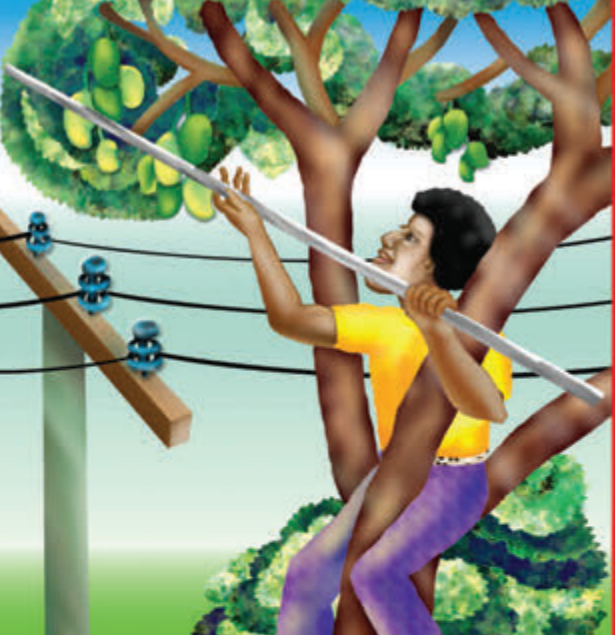
NOKEN USIM AIN STIK LONG PIKIM OL PRUT KLOSTU LONG OL PAWA LAIN. ILEKTRISITI I KEN