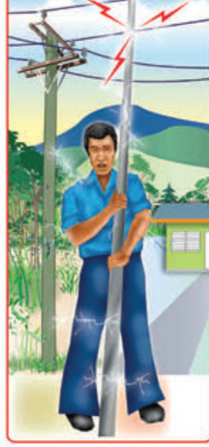
LUKAUT LONG OL PAWA LAIN TAIM YU WOK ANINIT