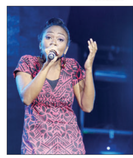
More than a performance – EMTV Vocal Fusion finalists - P2