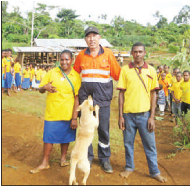
Ramu NiCo reps welcome by students and their pet.

Today China has over 100 key national universities, including Peking and Tsinghua Universities. Chinese spending has grown by 20% per year since 1999, now reaching over $100bn, and as many as 1.5 million science and engineering students graduated from Chinese universities in 2006.