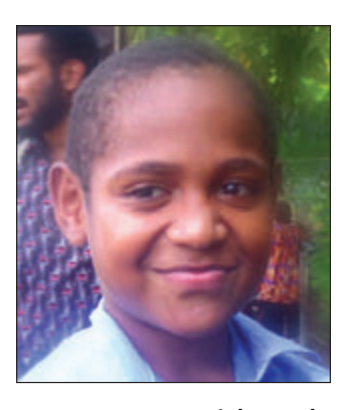
Age: 11 Province: Central and Gulf What is your ambition? Pilot. I have to study hard to get