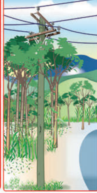
NOKEN LARIM DIWAI I GRO ANTAP OL PAWA LAIN

Plis ringim National Call Centre lo dispela namba long ripotim ol hevi bilong pawa: 7090 8000, 7653 5261 or 7653 5272 Email: callcentre@pngpower.com.pg