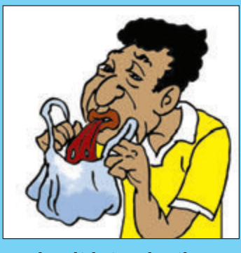
and spit into plastic...