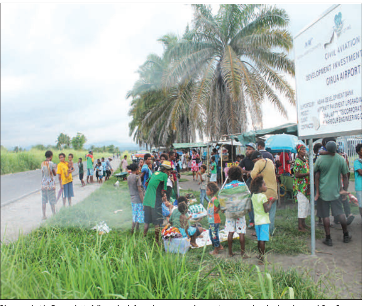
Girua market in Popondetta falls under informal economy where entrepreneurism is abundant and Oro Governor Gary Juffa has urged the vendors to keep the market clean and tidy.

Most LLGs are struggling to function effectively in most areas of the country due to lack of support both in terms of resource and limited un-