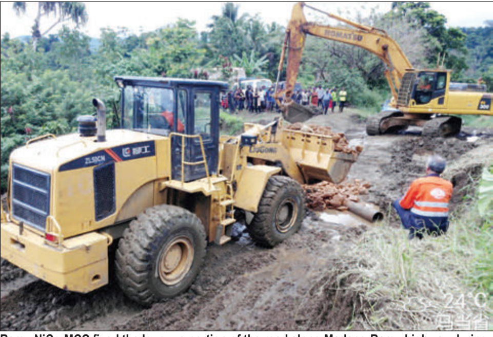
Ramu NiCo-MCC fixed the Iguruwe portion of the road along Madang-Ramu highway during its deteriorating stage