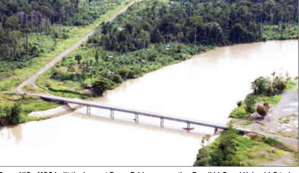
Ramu NiCo-MCC built the longest Ramu Bridge connecting Bundi LLG and Usino LLG today serves thousands of people. In the past, locals use dug-out canoes to cross the dangerous Ramu River

Major investors including Ramu NiCo do face "reality shows" when it comes to investment debacle in PNG, let alone other projects.