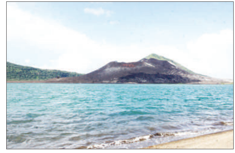
VOLCANO: Volcanoes are life threatening but at the same time too, sights of wonder as this active volcano at Matupit in Rabaul which is one of the much sought about places to visit while in East New Britain.

the schedules of the tourist ships and they gear up to it by ensuring that they have their wares ready to market and sell to the tourists.