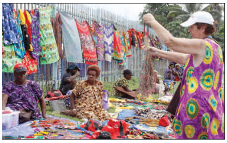
A DEFINITE BUY: This is what I want and I will take iot, this tourist seems to be saying as she admires this Sepik bilum.