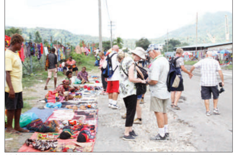
AROUND RABAUL TOWN: Tourists take a slow stroll from the market to other parts of the town.

They are a major attraction which is a must for all tourists into East New Britain. As an added incentive, landowners make it their business to decorate and cement the tunnel floor so tourists can gain access and easy movement to explore inside the tunnel.