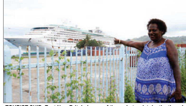
TOURIST SHIP: East New Britain is one of the main tourist destinations in PNG and every month, a tourist loaded vessel calls into the province such as this one.

Both Rabaul and Kokopo have one of the major tourists attraction which are the World war 11 tunnels. These huge tunnels were dug and build by the Japanese soldiers over 70 years ago and they remain intact to this day.