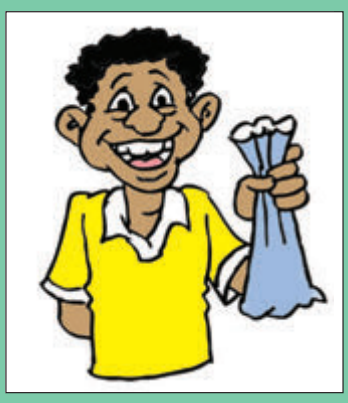
Carry a plastic bag when strolling out for a buai break...

How to avoid spitting buai around public areas and at your home