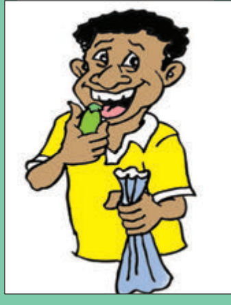
Skin the buai and drop skin in plastic bag...